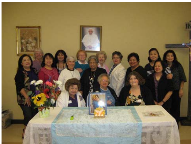
San Pedro Pastoral Region of L.A. Archdiocese held a monthly rosary in Torrance, hosted by Ct. St. Catherine #1378

May 22 is National Maritime Day in the United States each year. This day reflects the gratitude that Americans have for the maritime industry and the benefits it brings to the country. It also recognizes ships and seafarers who have held a special place in the nation's history. Some symbols that have been used to depict National Maritime Day include: an image or drawing of an anchor, strapped with a rope around the middle, to symbolize the maritime life.