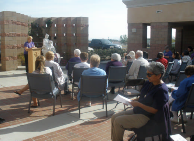
Diocese of San Bernardino held a monthly rosary in Victorville, hosted by Ct. Holy Innocents #2446